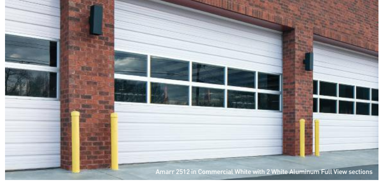
Amarr 2512 in Commercial White with 2 White Aluminum Full View sections

These open-back commercial steel doors are available in a variety of steel gauges and feature tongue and groove construction with a bottom weather seal to guard against the elements. These doors can be factory- or field-modified with CFC-free polystyrene insulation to fit the needed application.